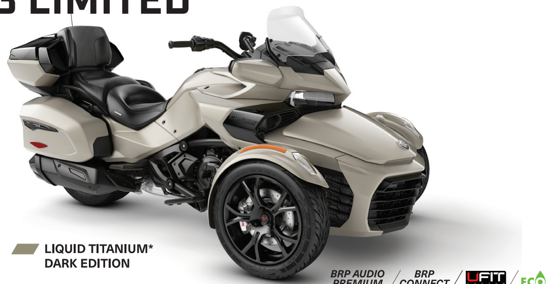
LIQUID TITANIUM* DARK EDITION

BRP AUDIO PREMIUM / BRP CONNECT / UFIT / ECO