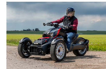
UNIQUE RALLY EXPERIENCE A vehicle designed for all-road trips with hand guards, rally comfort seat for a more reactive rider position, and adjustable large anti-slip foot pegs.