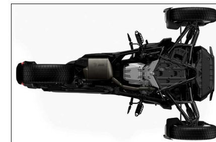
INCREASED VEHICLE PROTECTION Get extra protection for higher durability with front vehicle protection, aluminum skid plate under the vehicle, and reinforced rims.