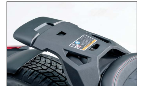
MAX MOUNT STRUCTURE Makes the unit 1+1 ready. It also increases the carrying capacity for different storage options.