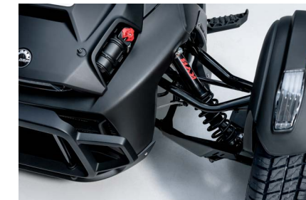
FULL KYB HPG SHOCKS Front and rear KYB HPG shocks with remote adjusters and 1 inch of extra suspension travel to optimise your ride and improve comfort.