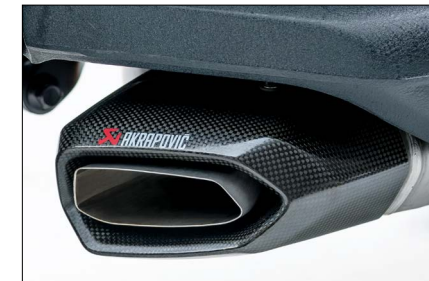
AKRAPOVIČ EXHAUST Unique sound signature and high-end exhaust.